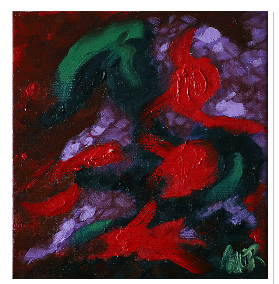
SMALL PIC NR.2 - 20x20cm