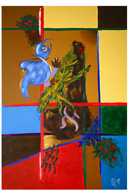
ALEPH'S GARDEN - 70x100 cm

In my artistic research, I explore the hidden links between shapes, colors and metaphysical meanings. In my works, the shapes often refer to trees, plants and flying animals. Always in transformation, my figures constitute metamorphoses that arise both from unconscious forces and from skilful calculation. In my paintings, space is not represented realistically: I usually prefer vertical structures, which symbolize the deep union between the physical and spiritual worlds. My goal is to express the human condition and transform it into an image on the canvas. For me, painting represents a threshold, beyond which another world opens up. In addiction, an important part of my suggestions are philosophical and literary stimuli: for example, the concept of Umgreifende (Embracing) of Karl Jaspers' philosophy of existence or the Grundworth Ich-Du (Fundamental Word I-You) from the Jewish theologian Martin Buber. All these cultural stimuli - although subterranean and occult - act sensitively in my artistic making. My motto is: "Art as a threshold of mystery".