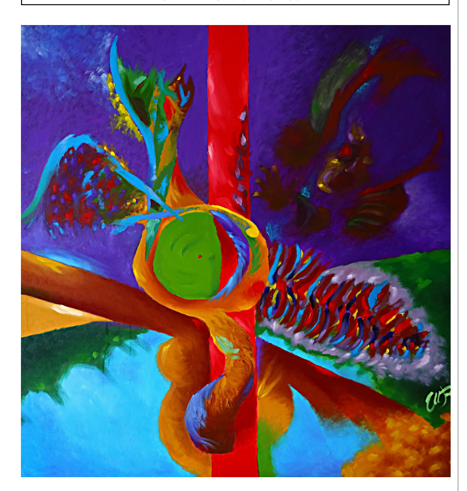
SOTERÌA - 100x100cm